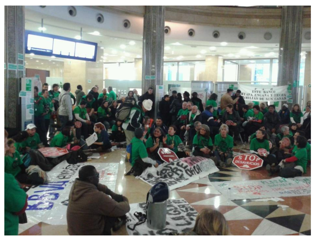
Occupation of the BBVA Bank headquarters in Barcelona.