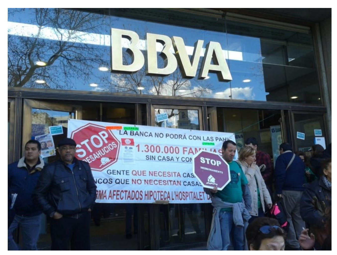
Occupation of the BBVA Bank headquarters in Barcelona.